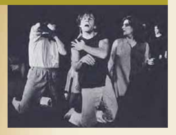
Image of The Open Theatre rehearsing The Serpent, a play about the nature of good and evil that included a recreation of the Zapruder film of President Kennedy's assassination (1968).